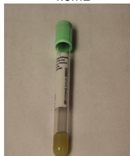
Mint Green PST Gel 4.5mL

Specimen Collection and Handling Procedures