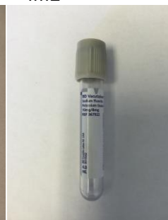
Gray NaFI 4mL