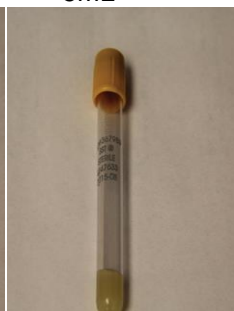
Gold SST Gel 5mL