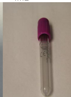
Lavender EDTA 4mL